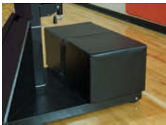
Padded Weight Box Cover

Special liftgate delivery charge or extreme manual lifting required if dock/forklift not available.