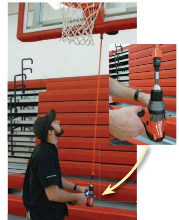
Optional BA931 Cordless Winch Winder Operation