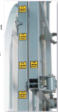
Easy-to-Read Height Indicator

From adult to youth play in 60 seconds...ZipCrank corner mount rim height adjusters are designed to avoid reduced backboard and rim rigidity common with other height adjustable goal systems • Movable framework slides up and down on two chrome plated 1" diameter rods riding in machined steel bushings • Height adjusters are installed between the backboard and the backboard support structure and when retrofitted on existing courts moves face of backboard 4¼" toward the free throw line • May require minor field drilling on some existing retrofit applications • Adjusts rim infinitely from official 10' to 8' heights and includes easy-to-read height indicator labels • Operated with the hand crank provided or with optional BA931 Cordless Winch Winder • See chart below for ordering details including use on center strut structures • 5-Year limited warranty.