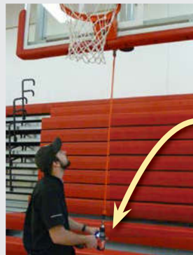
Optional BA931 Cordless Winch Winder Operation

Each ZipCrank Height Adjuster is supplied with one manual adjustment rod that allows easy up and down operation from the gym floor.