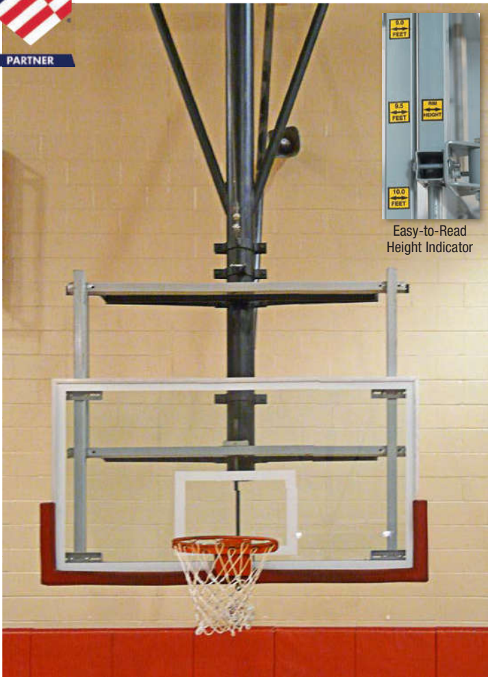
Easy-to-Read Height Indicator

From adult to youth play in 60 seconds... ZipCrank corner mount rim height adjusters are designed to avoid reduced backboard and rim rigidity common with other height adjustable goal systems • Movable framework slides up and down on two chrome plated 1" diameter rods riding in machined steel bushings • Height adjusters are installed between the backboard and the backboard support structure and when retrofitted on existing courts moves face of backboard 4¼" toward the free throw line • May require minor field drilling on some existing retrofit applications • Adjusts rim infinitely from official 10' to 8' heights and includes easy-to-read height indicator labels • Manual models are operated with the hand crank provided or with optional BA931 Cordless Winch Winder • Electric models operate with hard wired wall mounted BA975KS Wall Mounted Key Switch • See chart below for ordering details including use on center strut structures • Five-year limited warranty.