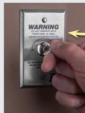
Optional BA975KS Electric Key Switch Operation