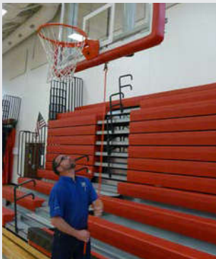
Standard Manual Crank Operation